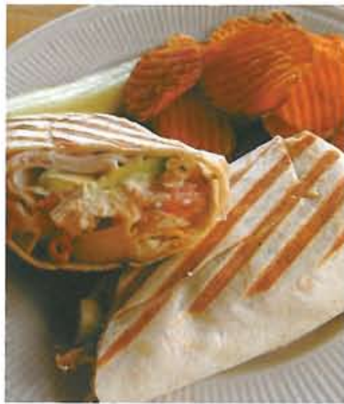
Turkey Panini Wrap $7.25