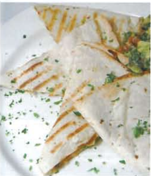
Smoked Chicken Quesadillas $7.95