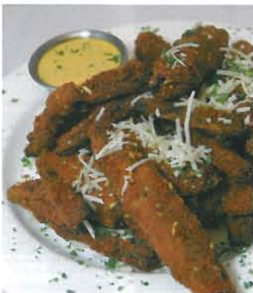
Portobello Fries $7.95