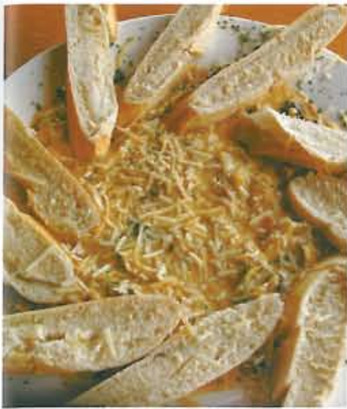
Artichoke Spinach Dip $6.95