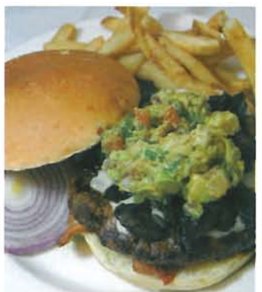
Monterey Burger $9.25