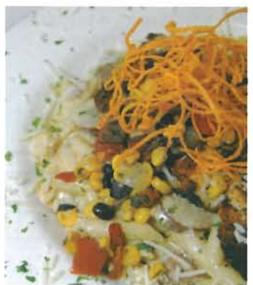
Blackened Chicken Penne Pasta $12.50