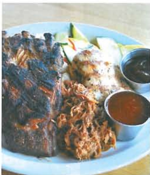
Kansas City BBQ Platter $18.50